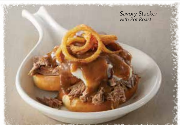
Savory Stacker with Pot Roast