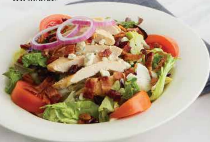
Cranberry Pecan Harvest Salad with Chicken