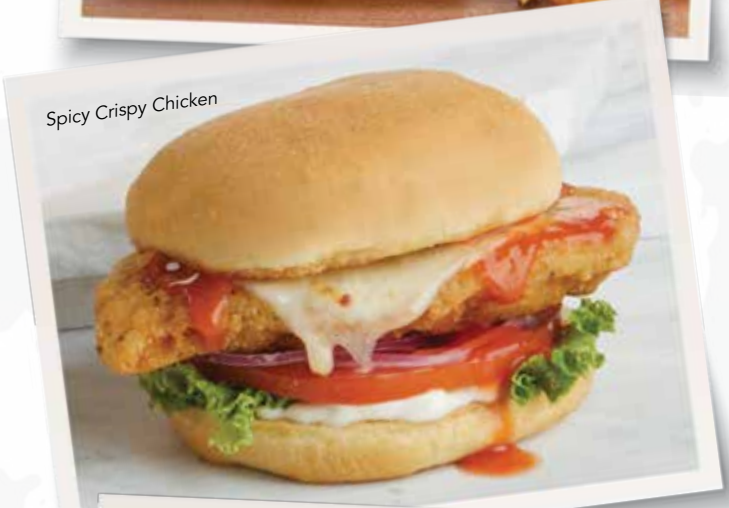
Spicy Crispy Chicken