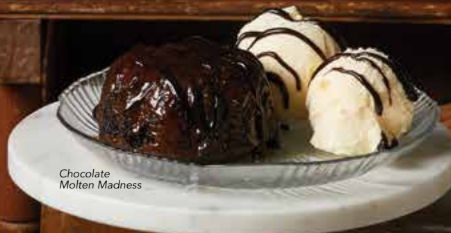
Chocolate Molten Madness