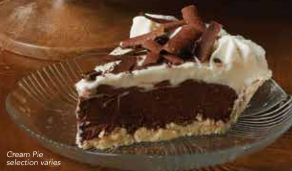
Cream Pie selection varies