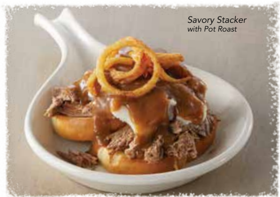
Savory Stacker with Pot Roast