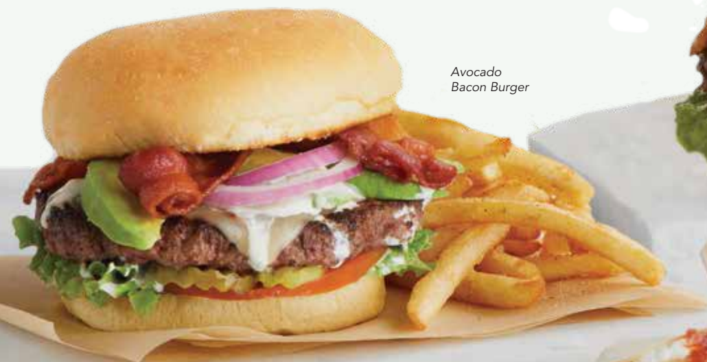
Avocado Bacon Burger