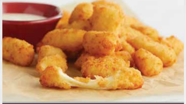
Fried Cheese Curds