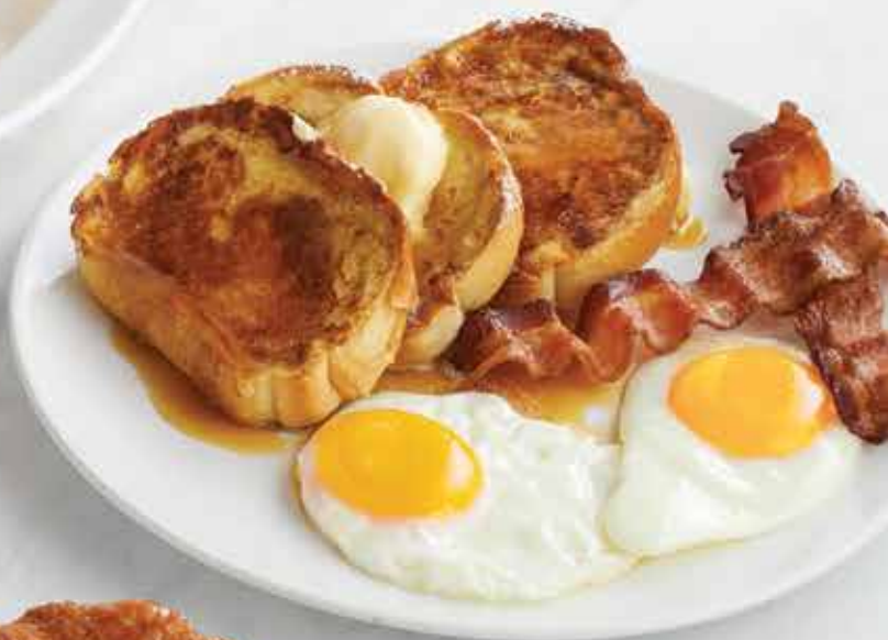
French Toast, Eggs & Bacon