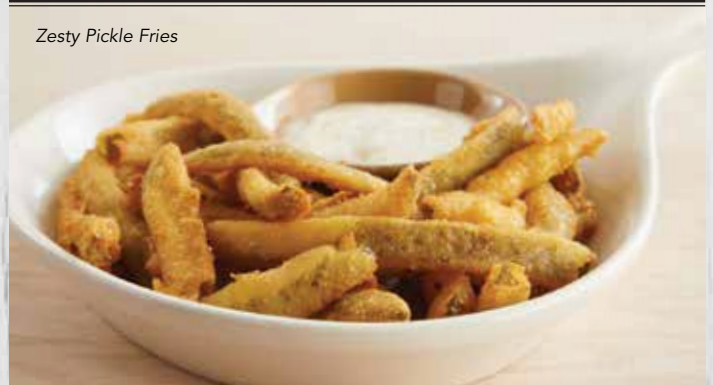
Zesty Pickle Fries

ranch 220 cal. • creamy garlic 310 cal. • barbecue 140 cal. honey mustard 260 cal. • Frank's RedHot® 0 cal.