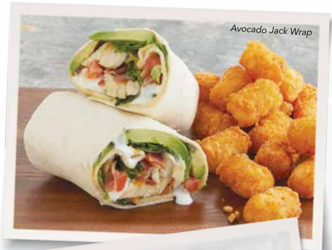
Avocado Jack Wrap

Tender sliced chicken, shredded cheese blend, chopped applewood-smoked bacon, and sliced tomato grilled until gooey on your choice of bread. 760-1430 cal. 10.99