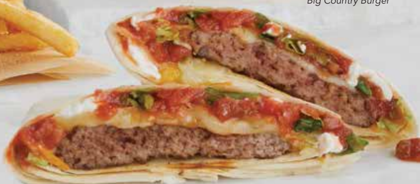
Aztec Quesadilla Burger