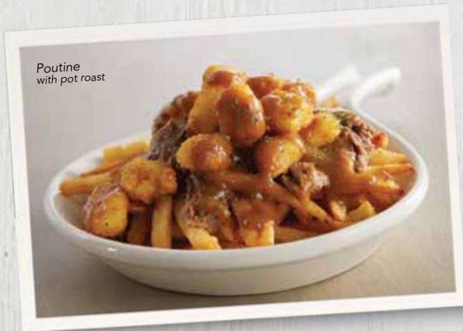
Poutine with pot roast

Thin-cut dill pickle fries coated in a premium cornmeal batter with a touch of spice. Served with creamy garlic sauce. 910 cal. 7.99