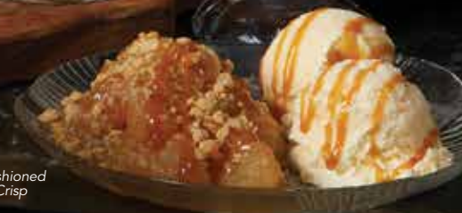
Old Fashioned Apple Crisp