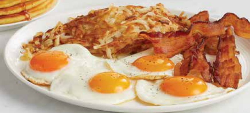
The Barn Buster®

*NOTICE: Can be cooked to order. Consuming raw or undercooked meats, poultry, seafood, shellfish, or eggs may increase your risk of foodborne illness, especially if you have certain medical conditions.