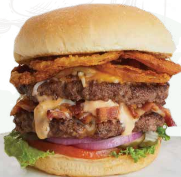
Big Country Burger