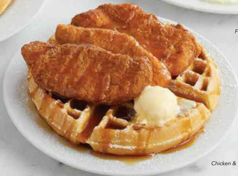
Chicken & Waffle