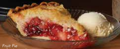
Fruit Pie selection varies