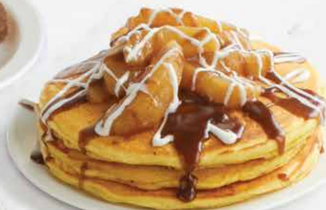
Cinnamon Apple Swirl Pancakes

Add bacon, sausage links, sausage patties, smoked sausage, or ham to any breakfast! 120-400 cal. 3.59