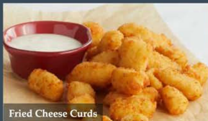
Fried Cheese Curds