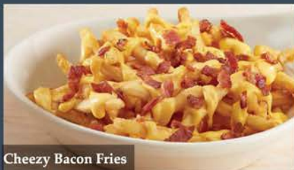
Cheezy Bacon Fries

Soft and chewy Bavarian perfection. Lightly seasoned with Country Kitchen seasoning and served with our warm craft beer cheese. (600 cal.) 8.99