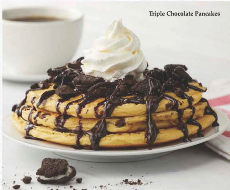
Triple Chocolate Pancakes

Three of our homemade pancakes covered in Oreo® cookie pieces and chocolate chips, drizzled with chocolate syrup and crowned with whipped topping. Served with hardwood-smoked bacon OR sausage. (1110-1230 cal.) 11.99 Pancakes only (930 cal.) 8.99