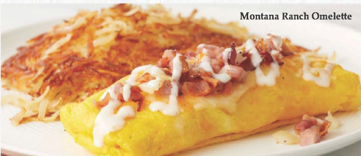
Montana Ranch Omelette

Bacon, ham, onion, shredded cheddar, with a zip of cool Ranch dressing. Served with your choice of grits OR home fries OR hash browns. (950-1390 cal.) 12.99