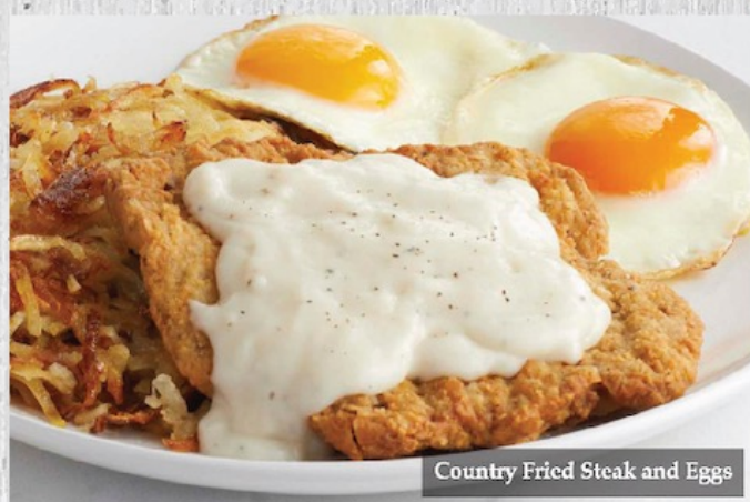
Country Fried Steak and Eggs