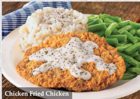
Chicken Fried Chicken

Hot Shot Your choice of sliced turkey OR meatloaf piled high on a bed of mashed potatoes and two slices of white bread, all covered in rich gravy. Served with one dinner side. (490-1240 cal.) 10.99