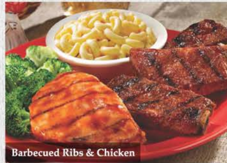
Barbecued Ribs & Chicken