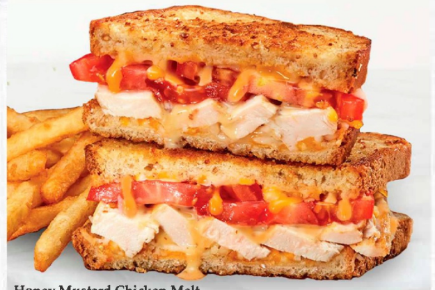
Honey Mustard Chicken Melt