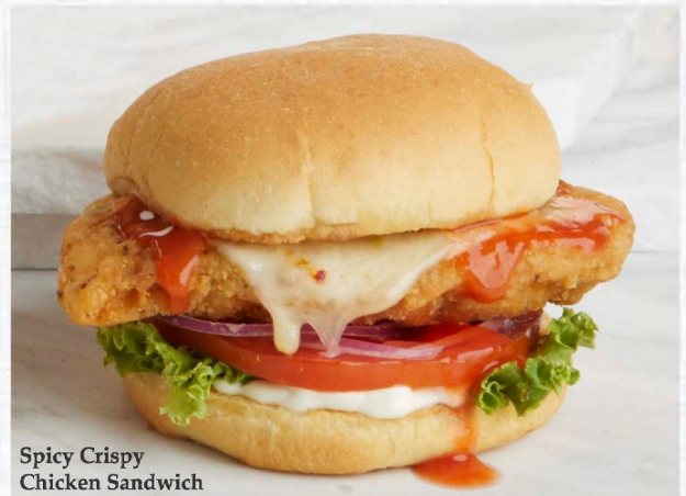
Spicy Crispy Chicken Sandwich

Tender grilled chicken breast topped with fresh tomato, shredded cheddar cheese, and honey mustard on your choice of grilled white, wheat, marbled rye, Texas toast, or sourdough. (1400-1460 cal.) 11.99