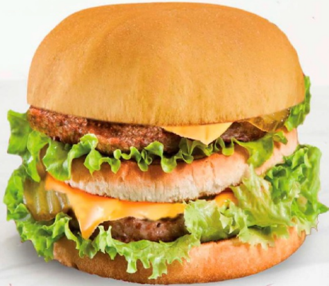
Country Boy Burger

Burgers are served with fries and creamy coleslaw. Substitute a small side salad for only 80¢ more.