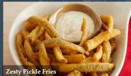
Zesty Pickle Fries