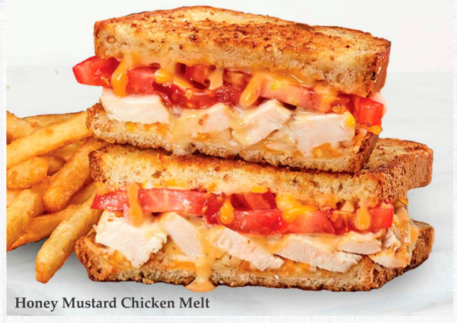
Honey Mustard Chicken Melt