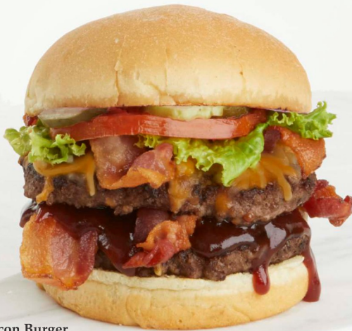
Big Bad Bacon Burger

Two 1/3 pound beef patties, both topped with American Cheese and applewood-smoked bacon, stacked and slathered in barbecue sauce. Crowned with lettuce, and tomato. (2040cal.) 14.99