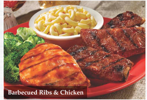
Barbecued Ribs & Chicken