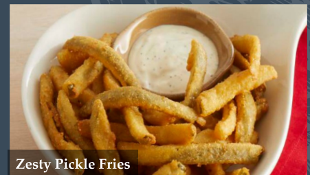
Zesty Pickle Fries