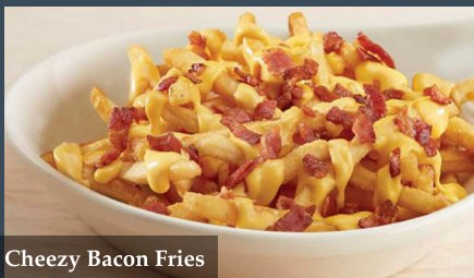
Cheezy Bacon Fries

Our spin on a Canadian classic! Seasoned Brew City® fries are piled with gooey fried cheese curds, then drenched in beef gravy, and sprinkled with parsley. (1070 cal.) 7.49