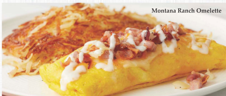
Montana Ranch Omelette

Bacon, ham, onion, shredded cheddar, with a zip of cool Ranch dressing. Served with your choice of grits OR home fries OR hash browns. (950-1390 cal.) 11.99