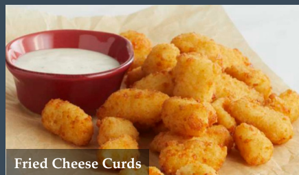
Fried Cheese Curds