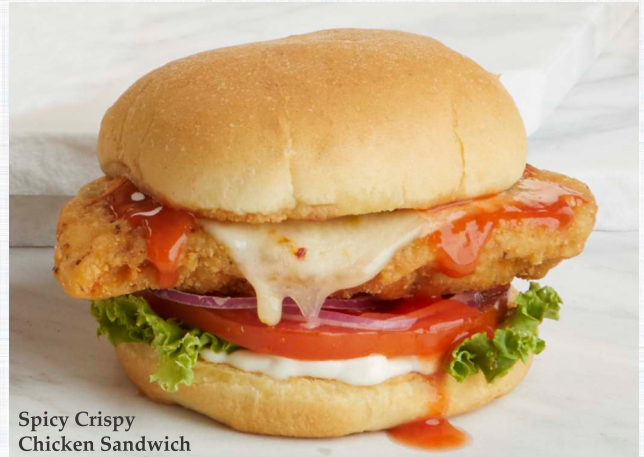
Spicy Crispy Chicken Sandwich

Tender grilled chicken breast topped with fresh tomato, shredded cheddar cheese, and honey mustard on your choice of grilled white, wheat, marbled rye, Texas toast, or sourdough. (1400-1460 cal.) 10.49