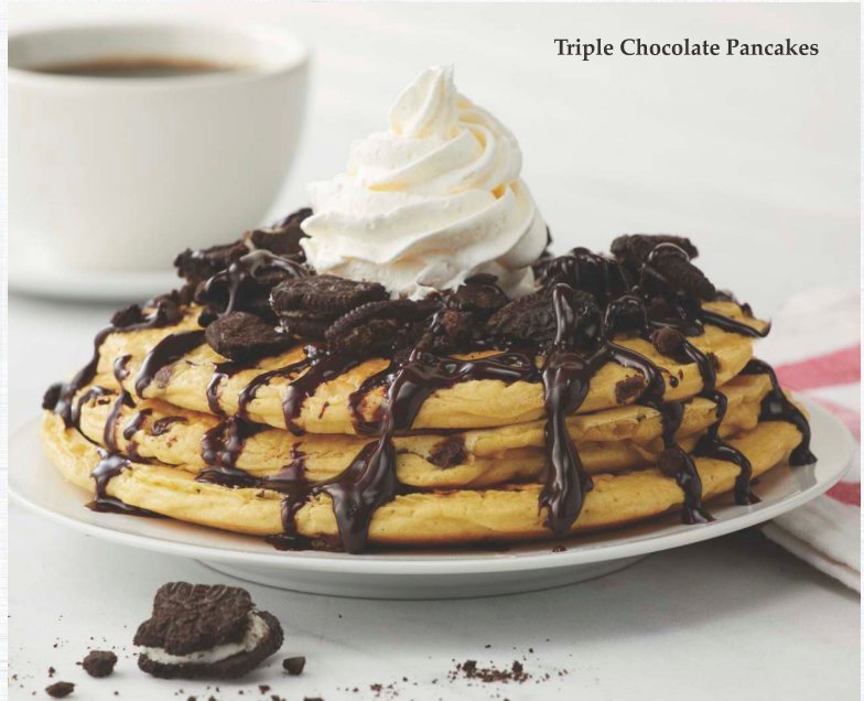
Triple Chocolate Pancakes

Three thick hand-dipped slices of Texas toast dusted with powdered sugar and cinnamon. Served with butter, hot syrup, and your choice of hardwood-smoked bacon OR sausage. (790-910 cal.) 9.99 French Toast only (610 cal.) 6.49