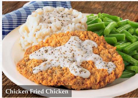
Chicken Fried Chicken