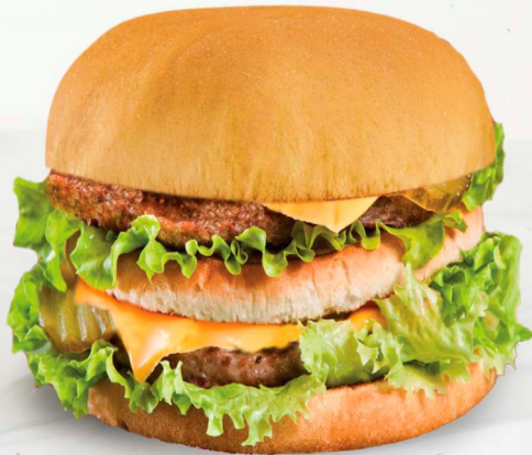
Country Boy Burger

Burgers are served with fries and creamy coleslaw. Substitute a small side salad for only 80¢ more.