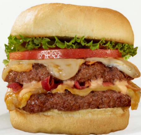
Big Country Burger

Two 1/3 pound burgers topped with slices of bacon, Swiss cheese, American cheese, grilled onion, tomato, lettuce, pickles, and our CK Special Sauce. (1940 cal.) 13.99