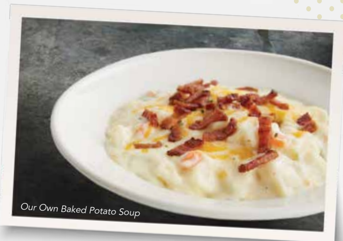
Our Own Baked Potato Soup