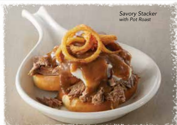
Savory Stacker with Pot Roast