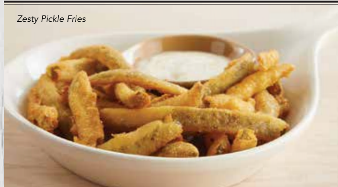
Zesty Pickle Fries

ranch 220 cal. • creamy garlic 310 cal. • barbecue 140 cal. honey mustard 260 cal. • Frank's RedHot® 0 cal.