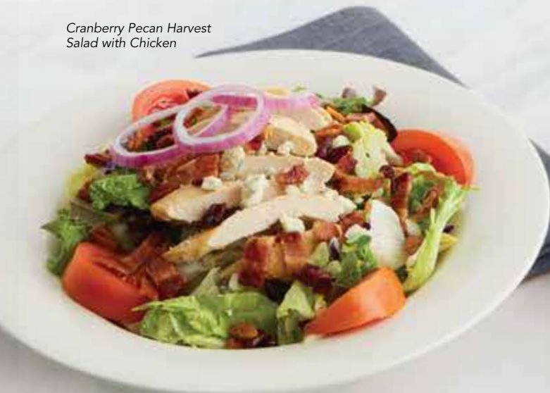
Cranberry Pecan Harvest Salad with Chicken

A bed of mixed garden greens topped with chopped applewood-smoked bacon, bleu cheese crumbles, dried cranberries, candied pecans, red onion rings, and fresh tomato wedges. Served with your choice of dressing. 480 cal. 10.49 Add chicken 130 cal. 3.00