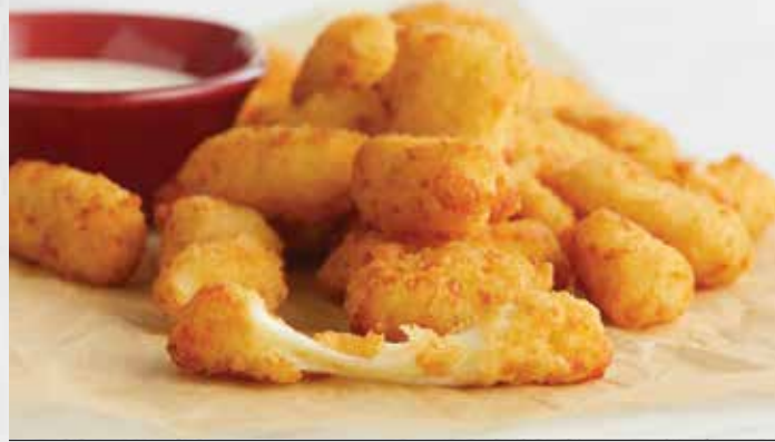
Fried Cheese Curds