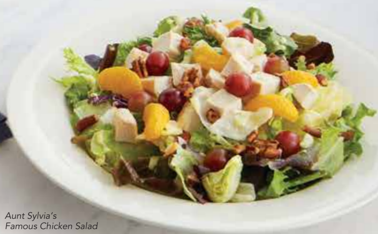
Aunt Sylvia's Famous Chicken Salad

Pieces of all-white chicken breast and red grapes tossed in our homemade creamy dressing and placed atop fresh greens along with sweet mandarin oranges and crunchy candied pecans. 840 cal. 11.49