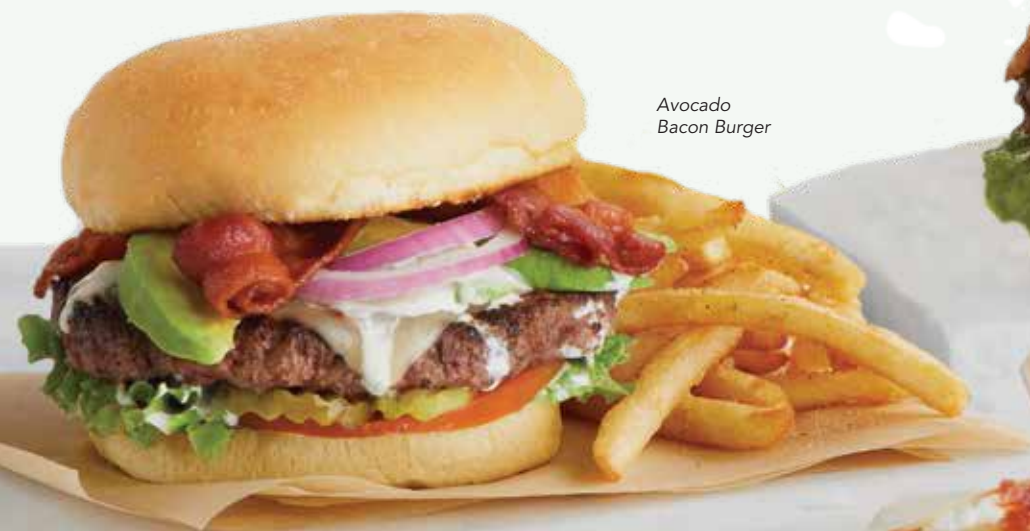
Avocado Bacon Burger