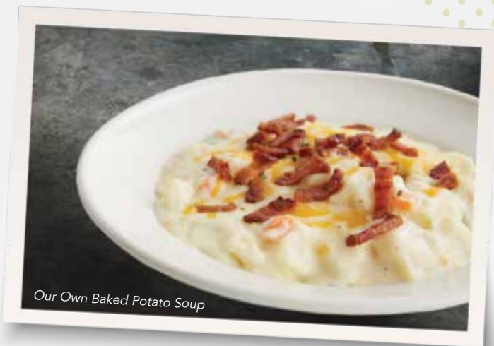
Our Own Baked Potato Soup

Creamy baked potato soup topped with our shredded four-cheese blend and chopped bacon. Bowl 390 cal. 4.69 • Cup 190 cal. 3.69