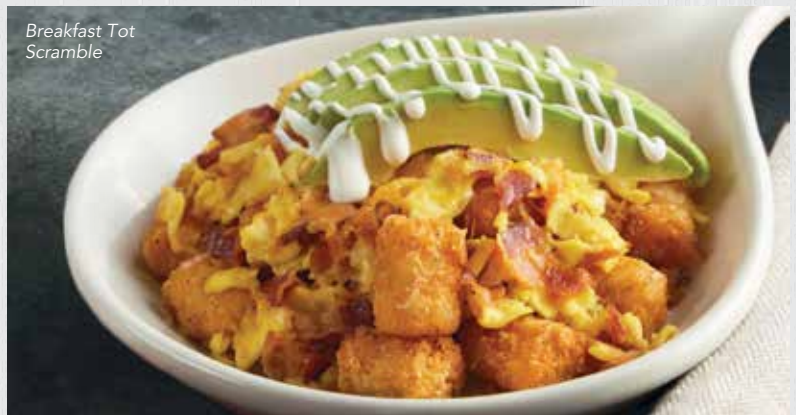
Breakfast Tot Scramble

Two eggs any style with chopped sausage, onion, and green peppers on a bed of seasoned hash browns. 570-930 cal. 10.59