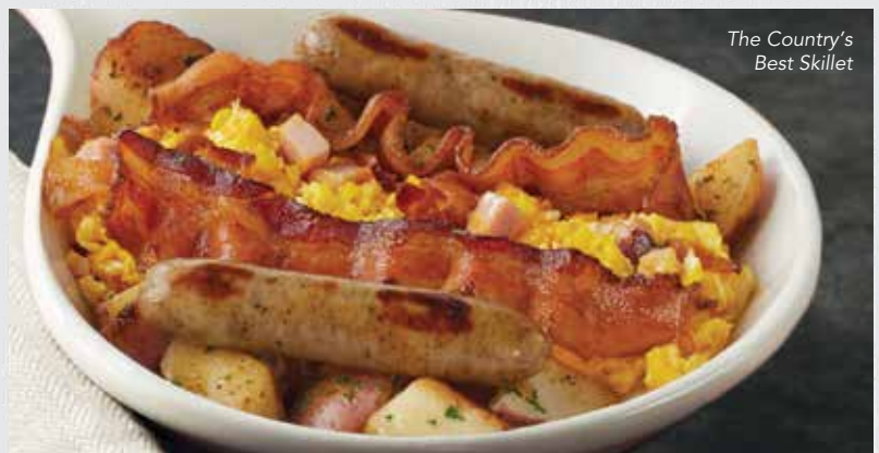
The Country's Best Skillet

Served with choice of toast, pancakes, fruit of the day, or biscuit.