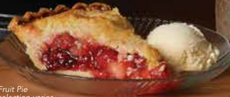
Fruit Pie selection varies