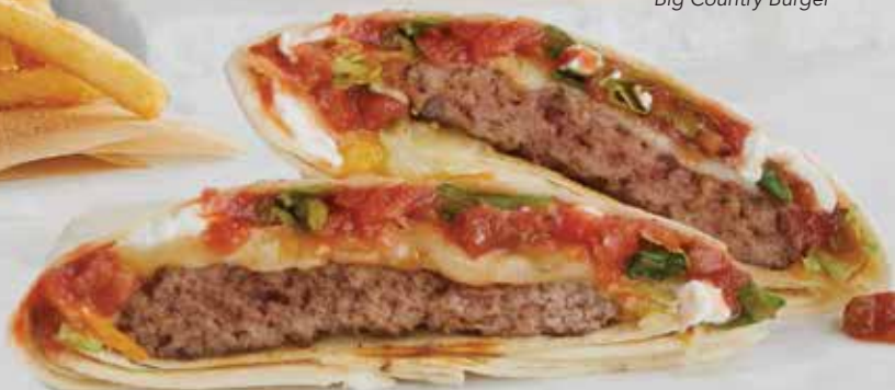
Aztec Quesadilla Burger