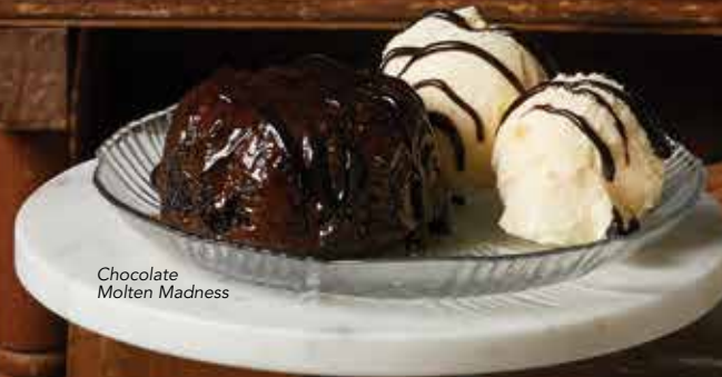
Chocolate Molten Madness