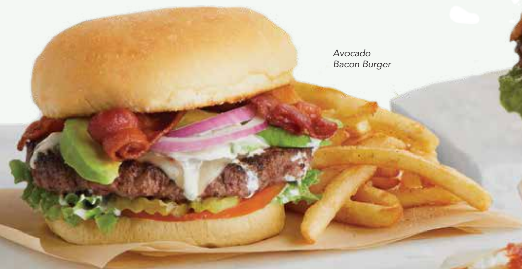
Avocado Bacon Burger