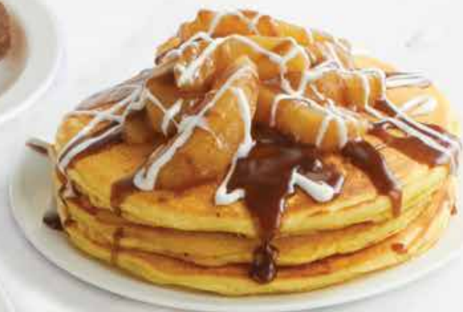
Cinnamon Apple Swirl Pancakes