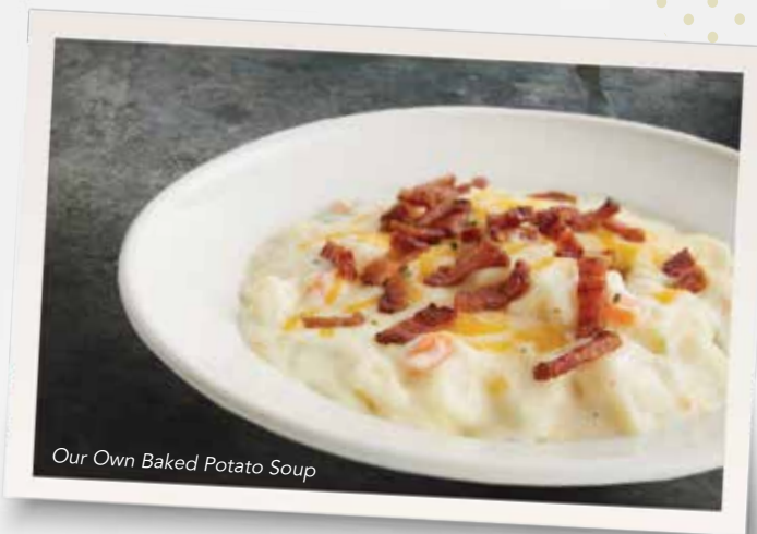
Our Own Baked Potato Soup

Creamy baked potato soup topped with our shredded four-cheese blend and chopped bacon. Bowl 390 cal. 4.69 • Cup 190 cal. 3.69