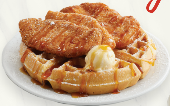
Chicken and Waffle