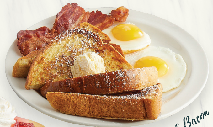
French Toast, Eggs & Bacon