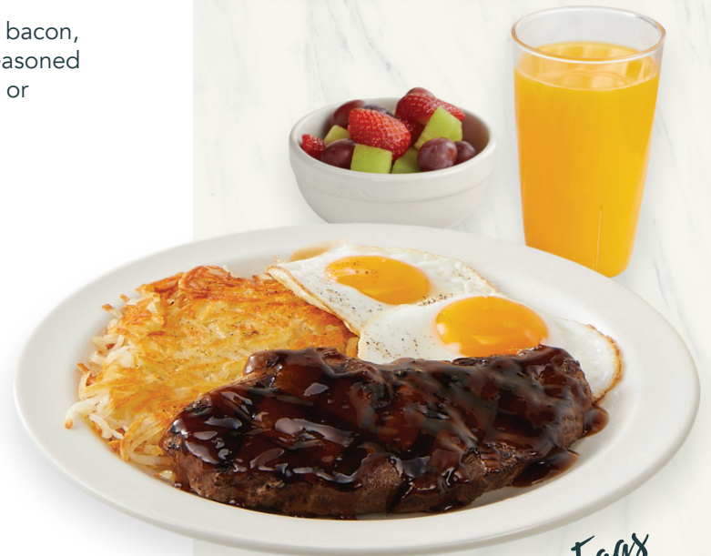
Bourbon Ribeye & Eggs