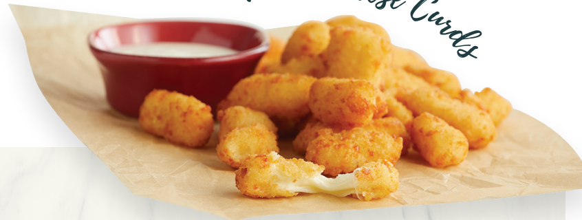
Fried Cheese Curds

Choice of two sauces: Ranch 220 cal. Barbecue 140 cal. Honey Mustard 260 cal. Creamy Garlic 310 cal.