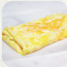
CHEESY OMELETTE 220 cal.