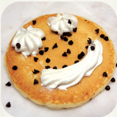
MR. CHIPPY® 430 cal.