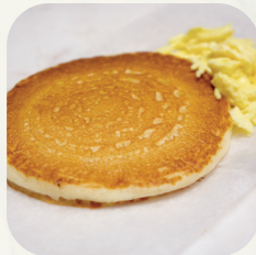
CAKE 'N' EGG 260 cal.