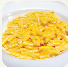
MAC & CHEESE 300 cal.