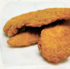
CHICKEN TENDERS 470 cal.