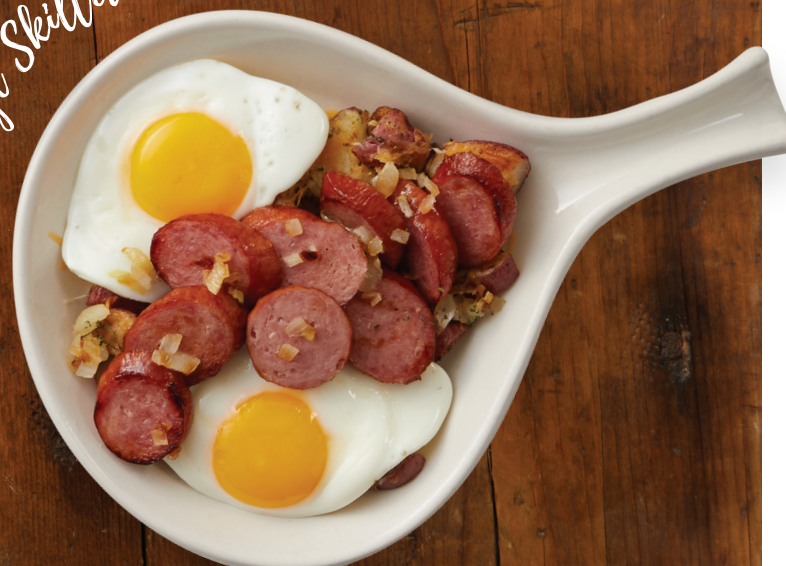
Smoked Sausage Skillet

*NOTICE: Can be cooked to order. Consuming raw or undercooked meats, poultry, seafood, shellfish, or eggs may increase your risk of foodborne illness, especially if you have certain medical conditions.