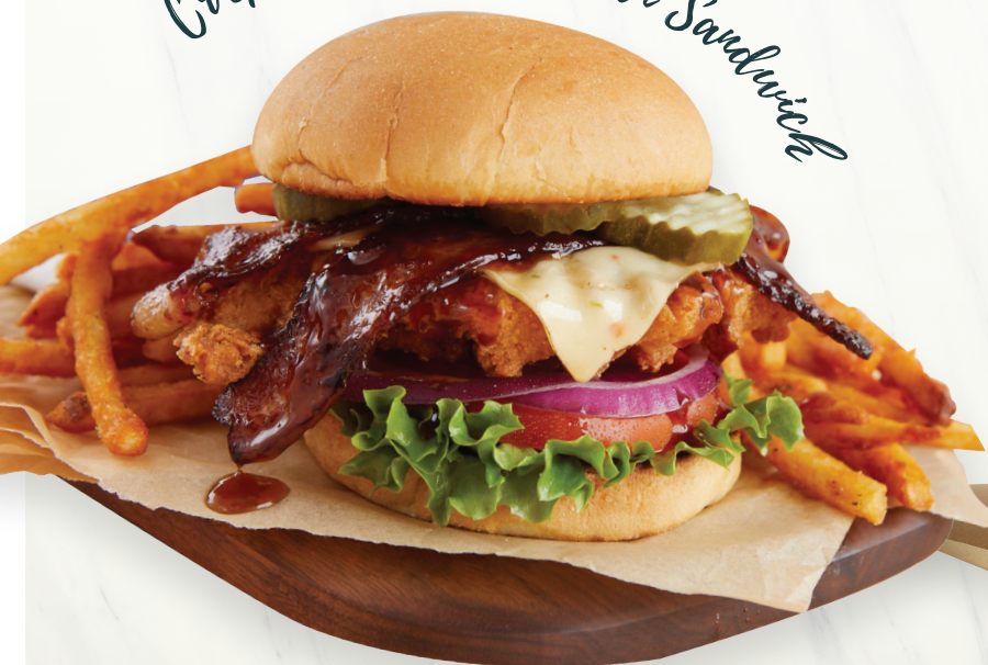
Crispy Bourbon Chicken Sandwich