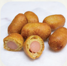
MINI CORN DOGS 380 cal.