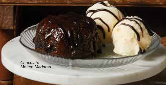
Chocolate Molten Madness