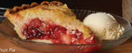
Fruit Pie selection varies