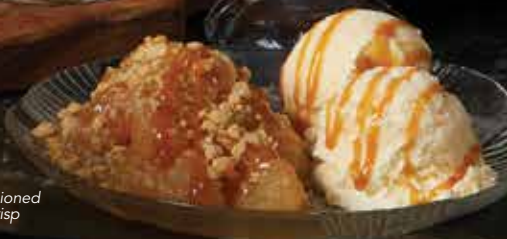
Old Fashioned Apple Crisp