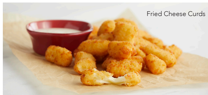
Fried Cheese Curds

White cheddar cheese curds, lightly breaded and fried until golden. Served with a side of homemade ranch dressing. 1232 cal. 9.99