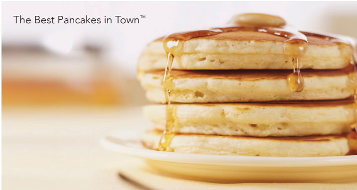
The Best Pancakes in Town™