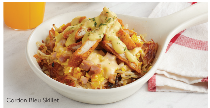
Cordon Bleu Skillet

On a golden bed of hash browns we layer a tender cut of grilled ham, a heap of fluffy scrambled eggs, and smother it all with cheese sauce. 853-1182 cal. 11.29