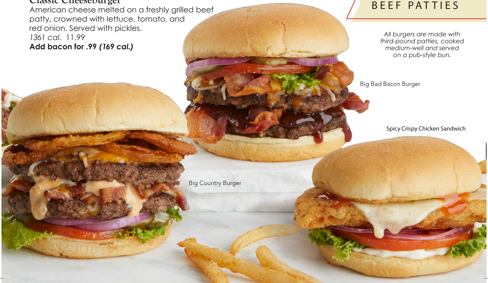
Big Bad Bacon Burger

All burgers are made with third-pound patties, cooked medium-well and served on a pub-style bun.