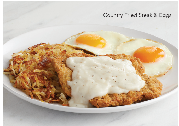
Country Fried Steak & Eggs