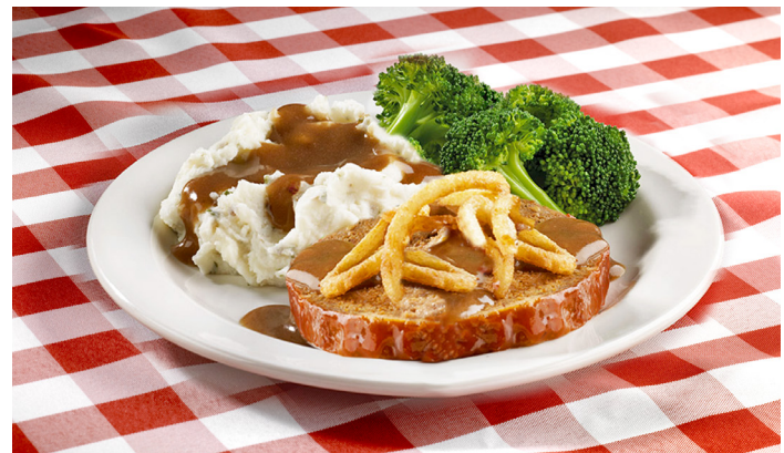
Lighter Fare Meatloaf