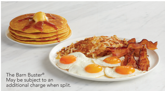
The Barn Buster® May be subject to an additional charge when split.

Two English muffin halves grilled and topped with ham steak, two basted eggs, and creamy hollandaise sauce. Garnished with parsley and served with seasoned hash browns. 994 cal. 11.49