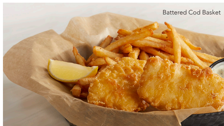
Battered Cod Basket