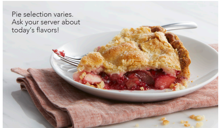
Pie selection varies. Ask your server about today's flavors!

Mini Mania Sundaes 2.99 One scoop with your choice of topping. Mini Chocolate 191 cal. • Mini Caramel 191 cal. • Mini Turtle 244 cal.