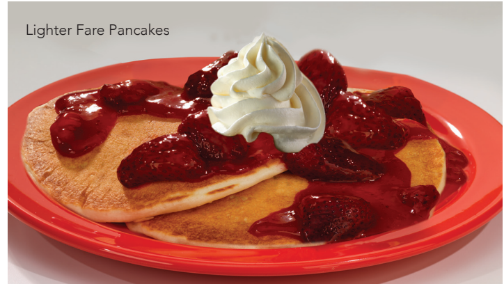
Lighter Fare Pancakes

Our special recipe! Three thick, hand-dipped French bread slices topped with powdered sugar and your choice of strawberry topping or Country Baked Apples and whipped topping. 581-592 cal. 8.79