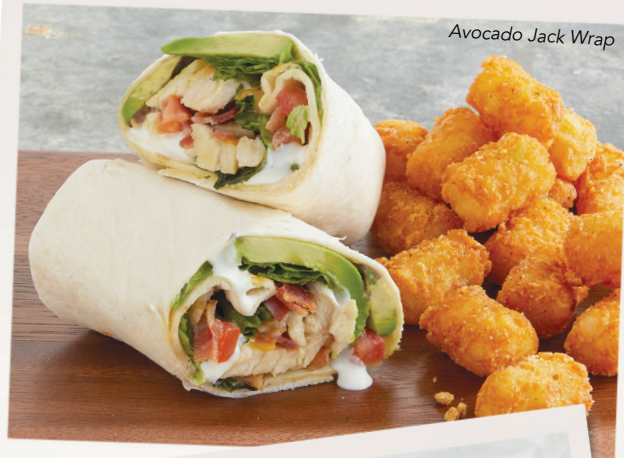
Avocado Jack Wrap

Tender sliced chicken, shredded cheese blend, chopped applewood-smoked bacon, and sliced tomato grilled until gooey on your choice of bread. 760-1430 cal. 11.99