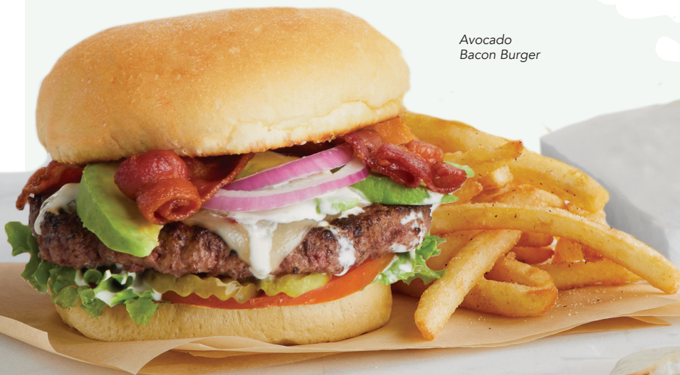
Avocado Bacon Burger

A seasoned beef patty topped with pepper jack cheese, applewood-smoked bacon, and sliced avocado, dripping with homemade ranch dressing. Crowned with fresh lettuce, tomato, and red onion. 1050-1630 cal. 12.99