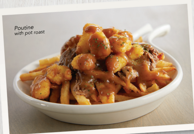
Poutine with pot roast

Thin-cut dill pickle fries coated in a premium cornmeal batter with a touch of spice. Served with creamy garlic sauce. 910 cal. 7.99