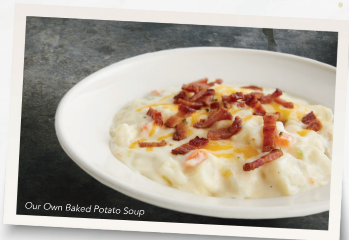
Our Own Baked Potato Soup