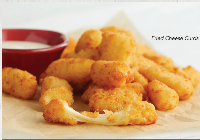
Fried Cheese Curds