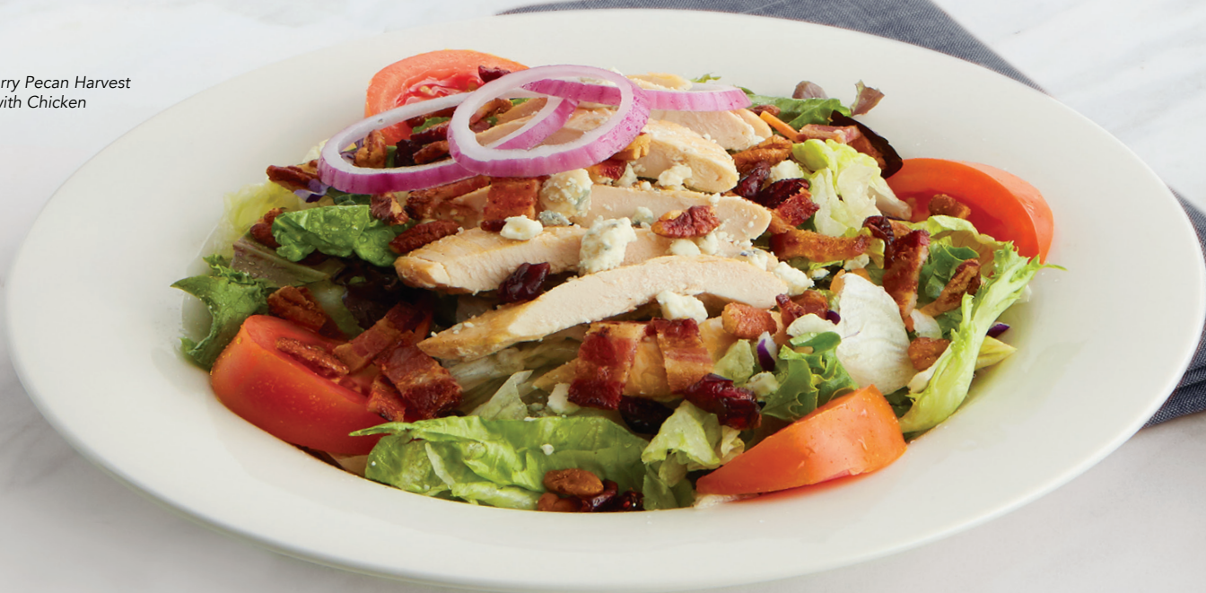
Cranberry Pecan Harvest Salad with Chicken

A bed of mixed garden greens topped with chopped applewood-smoked bacon, bleu cheese crumbles, dried cranberries, candied pecans, red onion rings, and fresh tomato wedges. Served with your choice of dressing. 480 cal. 9.99 • Add chicken 130 cal. 2.99