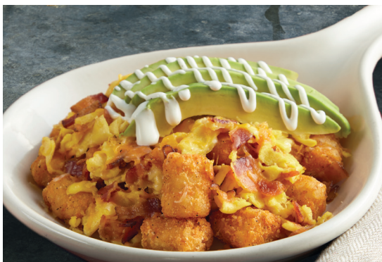
Breakfast Tot Scramble

Served with choice of toast, pancakes, fruit of the day, or biscuit.