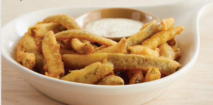
Zesty Pickle Fries