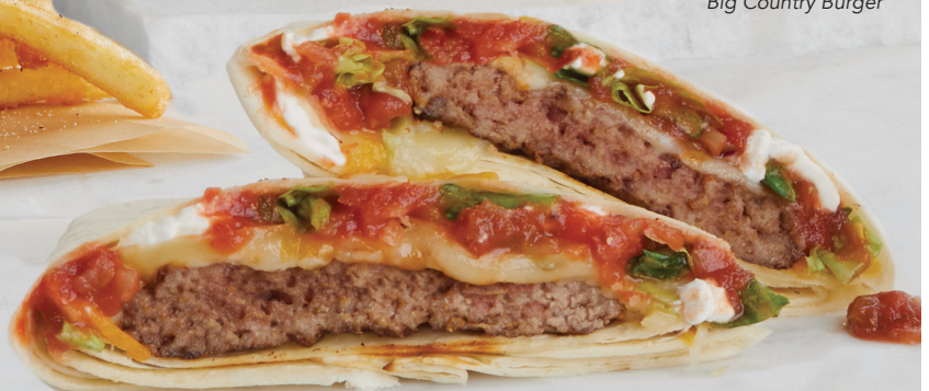
Aztec Quesadilla Burger