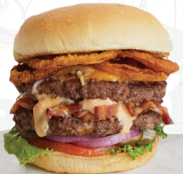
Big Country Burger