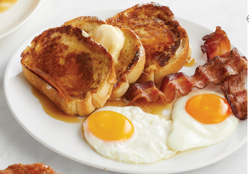
French Toast, Eggs & Bacon