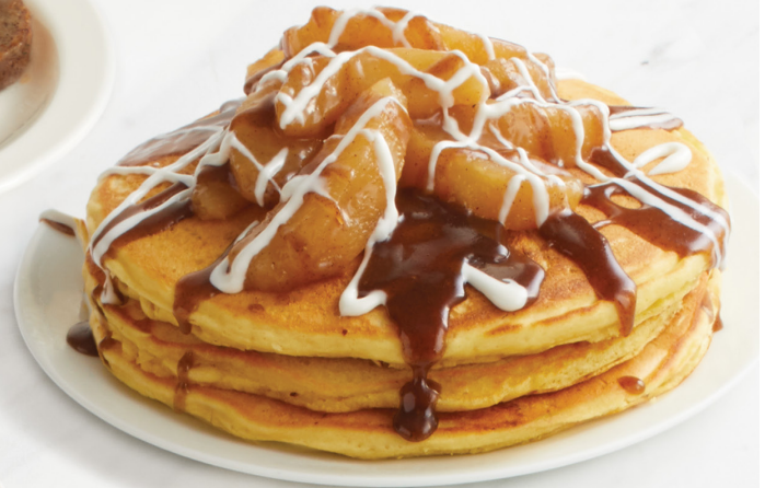
Cinnamon Apple Swirl Pancakes