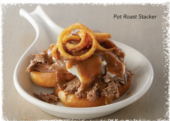
Pot Roast Stacker