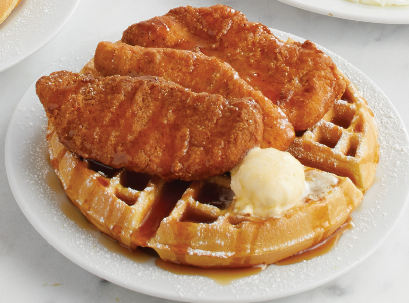
Chicken & Waffle