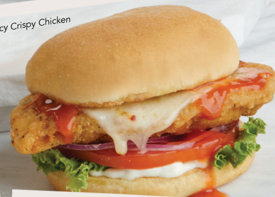
Spicy Crispy Chicken