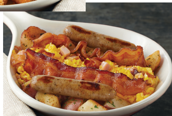
The Country's Best Skillet