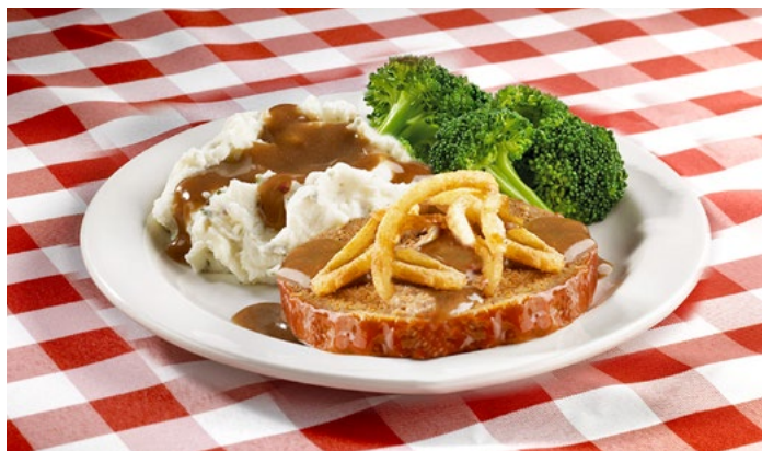
Lighter Fare Meatloaf