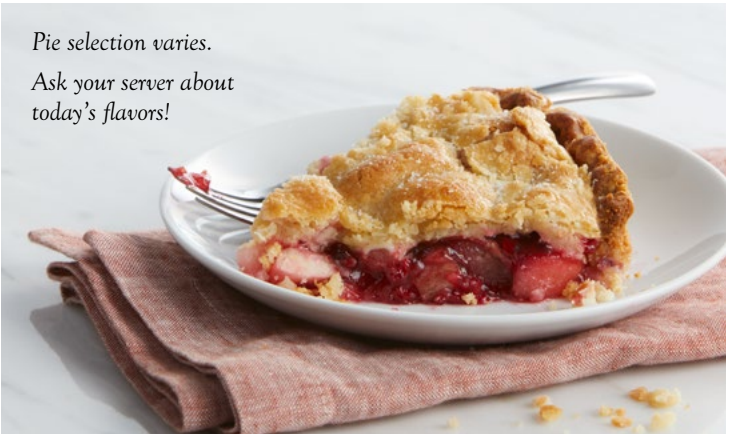
Pie selection varies. Ask your server about today's flavors!