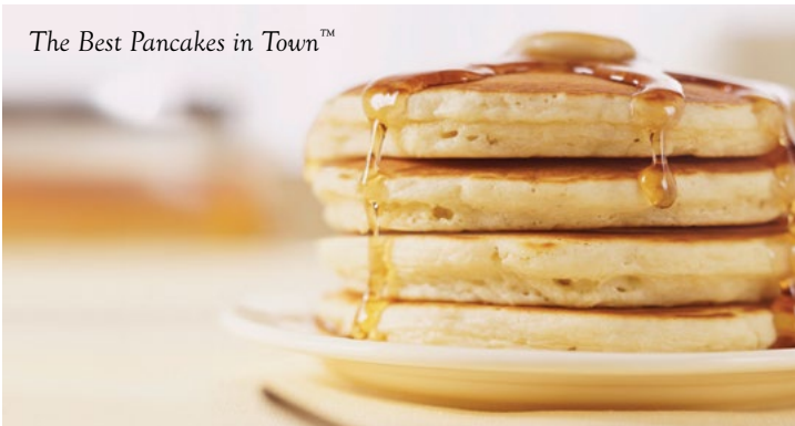
The Best Pancakes in Town™