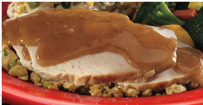
Lighter Fare Turkey

Oven-roasted turkey, served with homemade sage stuffing and topped with turkey gravy. Served with cranberry sauce. 597-1069 cal. 10.29