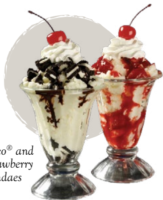
Oreo® and Strawberry Sundaes