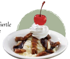
Mini Turtle Sundae