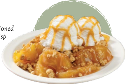
Old Fashioned Apple Crisp