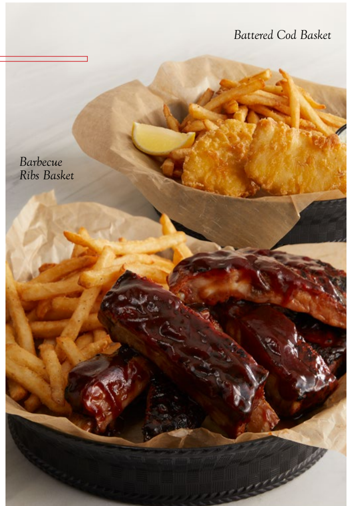
Battered Cod Basket

2000 calories a day is used for general nutrition advice, but calorie needs vary.