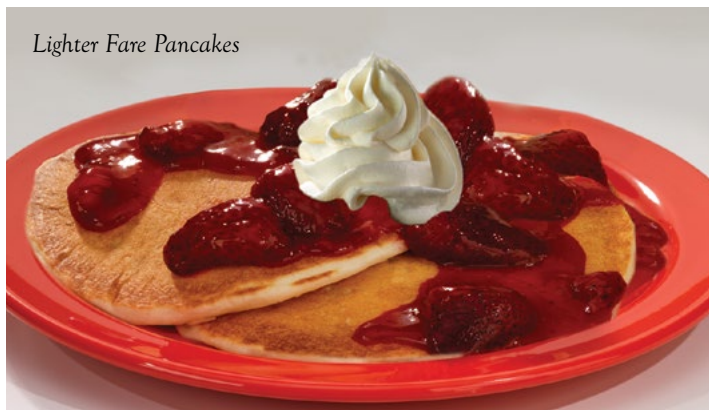
Lighter Fare Pancakes

Our special recipe! Three thick, hand-dipped French bread slices topped with powdered sugar and your choice of strawberry topping or Country Baked Apples and whipped topping. 581-592 cal. 6.99