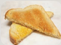
TOAST 260-320 cal.