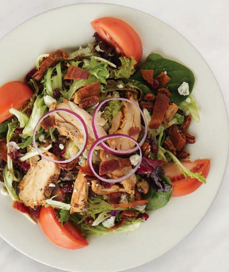
Cranberry Pecan Harvest Salad

Battered fish and breaded popcorn shrimp served with tartar sauce, cocktail sauce, and a lemon wedge. 1630 cal. 16.99