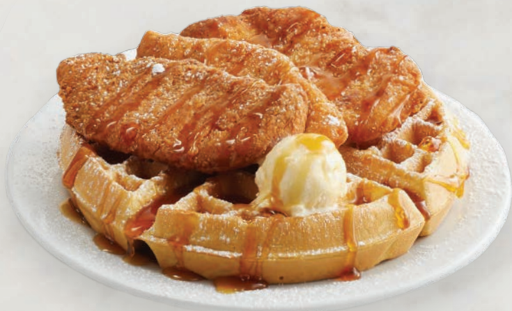
Chicken and Waffle