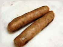
SAUSAGE LINKS 160 cal.