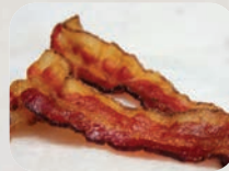
BACON STRIPS 90 cal.