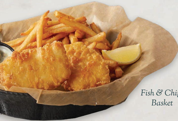
Fish & Chips Basket

Catch incredible flavor with our wild-caught Alaska pollock fillets fried golden brown and served with tartar sauce and a lemon wedge. 1390 cal. 15.99