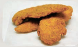
CHICKEN TENDERS 470 cal. w/o dipping sauce