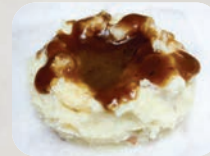
MASHED POTATOES AND GRAVY 190-200 cal.