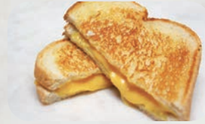
GRILLED CHEESE 410 cal.