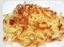
HASH BROWNS 240 cal.