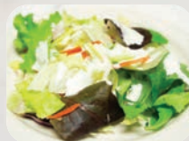
SALAD 5 cal. w/o drssing