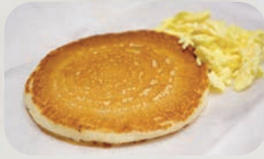
CAKE 'N' EGG 320 cal.