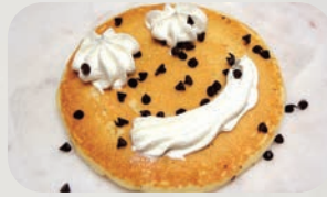
MR. CHIPPY® 490 cal.