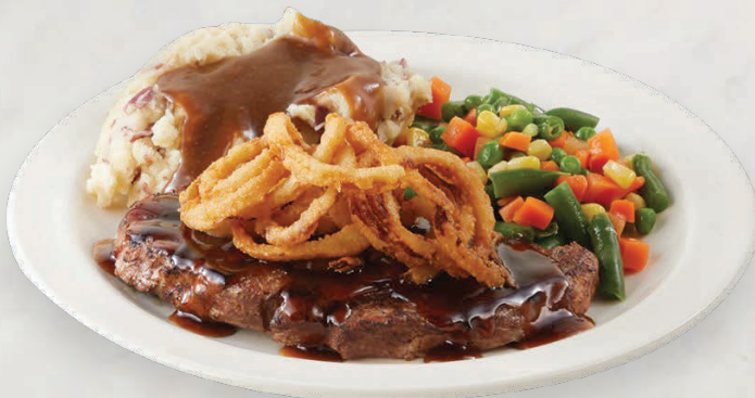
Bourbon Ribeye Steak

One pound of fire-braised pork ribs slathered in sweet and tangy barbecue sauce. 1410-1750 cal. 19.99