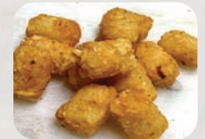
TATER TOTS 310 cal.