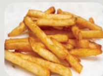
FRENCH FRIES 340 cal.