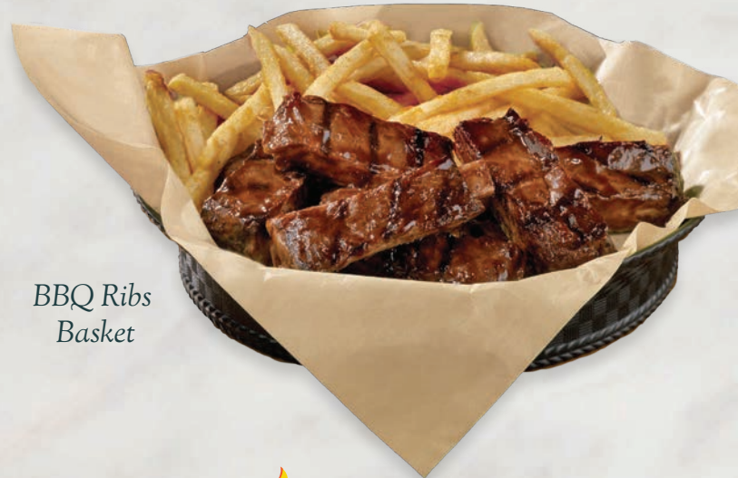
BBQ Ribs Basket