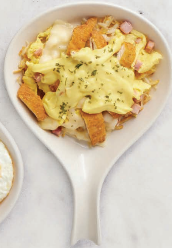
Cordon Bleu Skillet