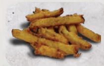
PICKLE FRIES 300 cal.