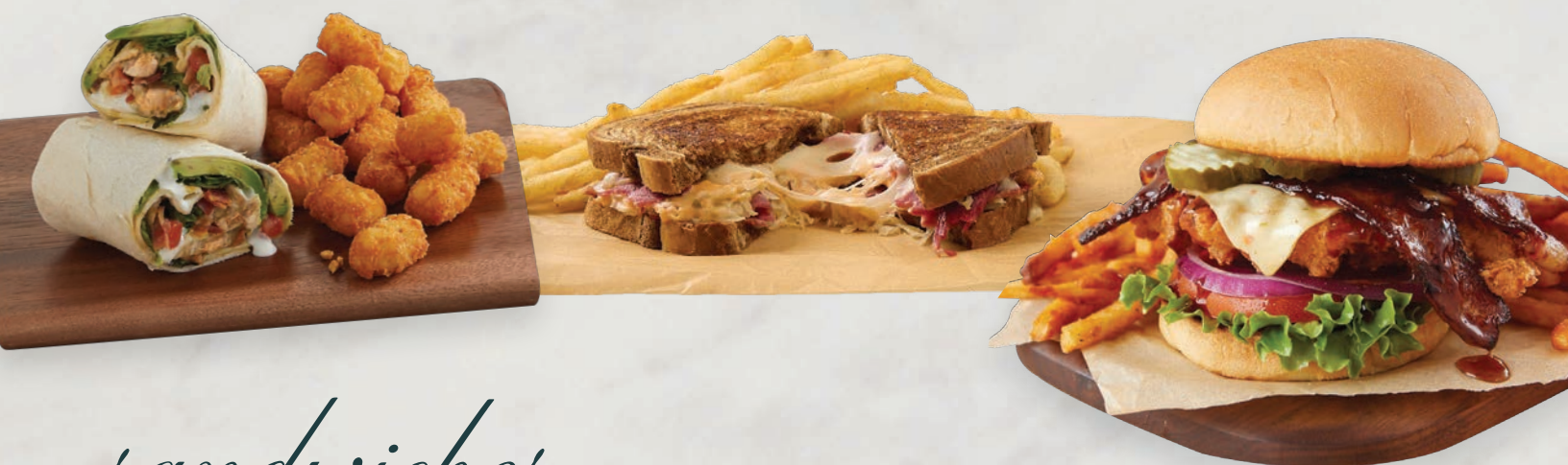
Crispy Bourbon Chicken Sandwich