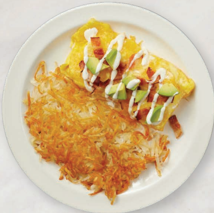
Bacon Avocado Ranch Omelette