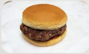
BURGER 630 cal.