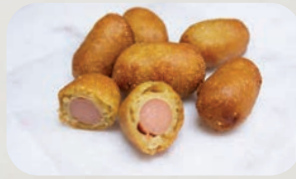
CORN DOG BITES 380 cal.