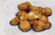
CHEESE CURDS 510 cal.