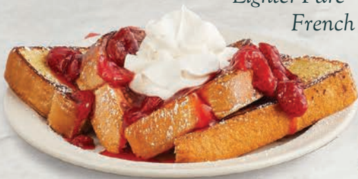
Lighter Fare French Toast