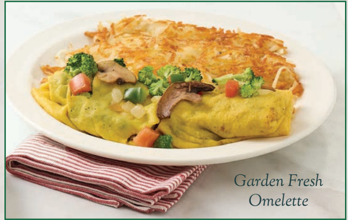
Garden Fresh Omelette

Bacon, ham, onion, shredded four-cheese blend and a zip of ranch dressing. 780-1310 cal. 16.29