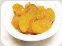
COUNTRY BAKED APPLES 120 cal.