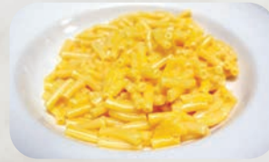
MAC AND CHEESE 300 cal.