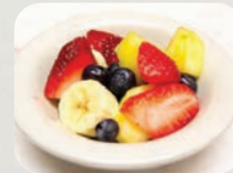
FRUIT OF THE DAY Varies