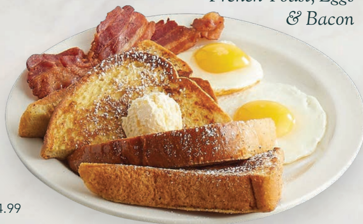
French Toast, Eggs & Bacon

A Belgian waffle dusted with powdered sugar, alongside two eggs any style and two strips of applewood-smoked bacon. Served with butter and syrup. 610-640 cal. 13.99