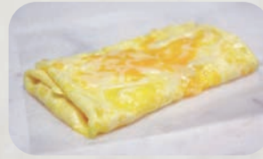
CHEESY OMELETTE 220 cal.