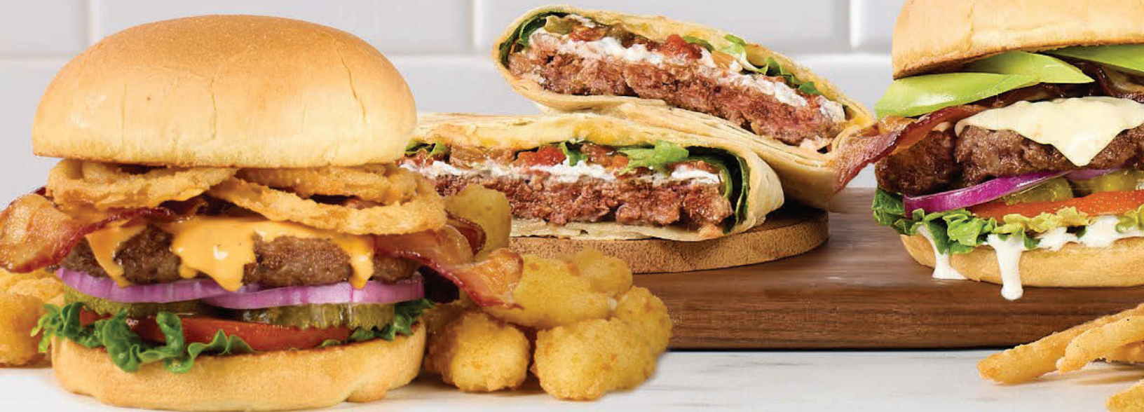
Avocado Bacon Burger