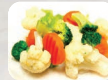
VEGGIE OF THE DAY Varies