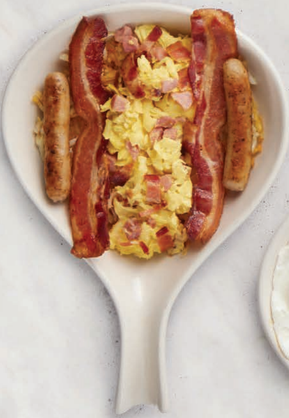
The Country's Best Skillet

Served with choice of toast, pancakes, or fruit of the day.