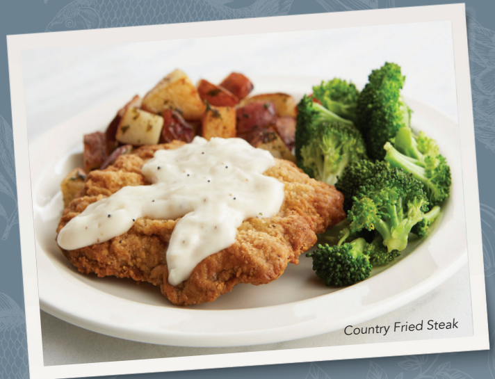
Country Fried Steak

Tender pot roast bathed in savory beef gravy and topped with crispy Onion Tangles®. 600-1640 cal. 15.99