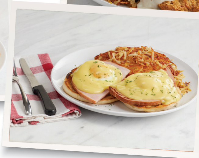
Classic Eggs Benedict

*NOTICE: Can be cooked to order. Consuming raw or undercooked meats, poultry, seafood, shellfish, or eggs may increase your risk of foodborne illness, especially if you have certain medical conditions.