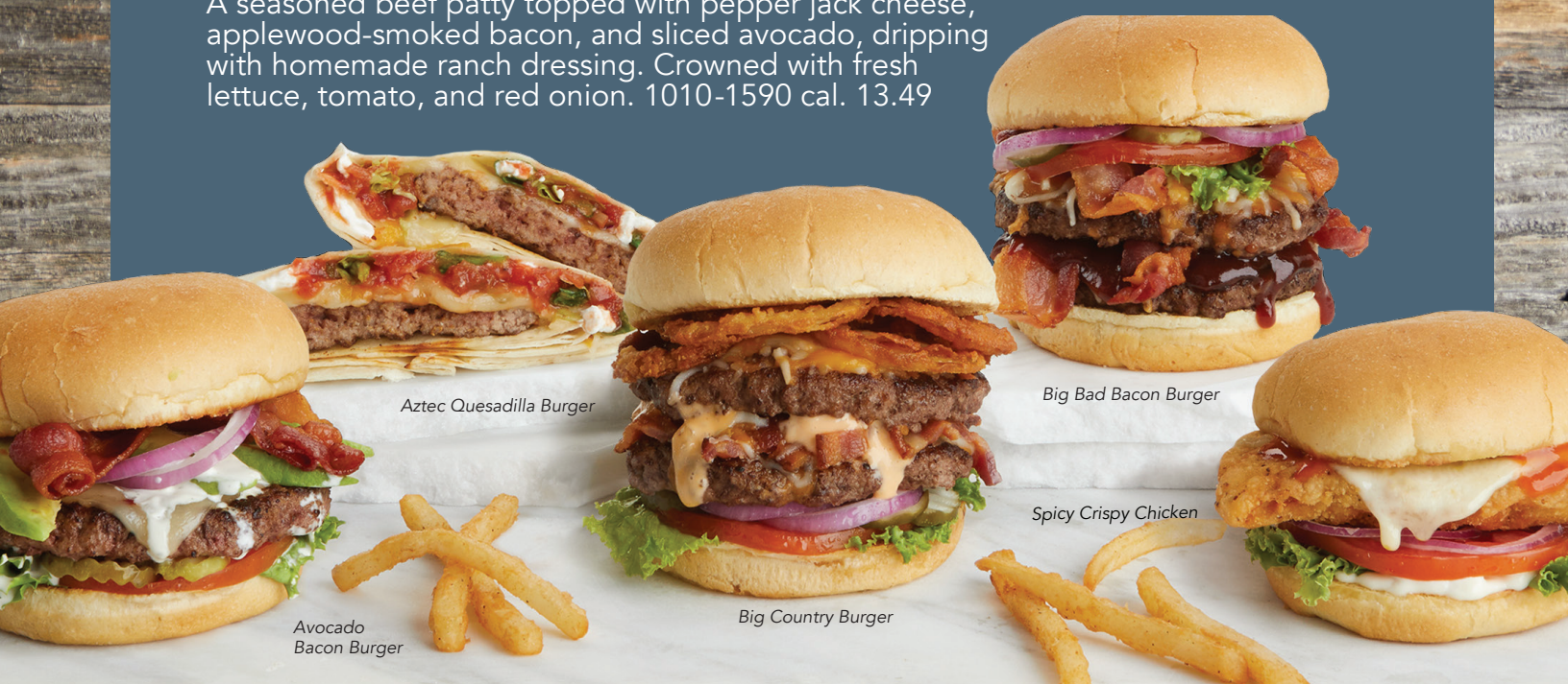
Aztec Quesadilla Burger

A seasoned beef patty topped with pepper jack cheese, applewood-smoked bacon, and sliced avocado, dripping with homemade ranch dressing. Crowned with fresh lettuce, tomato, and red onion. 1010-1590 cal. 13.49