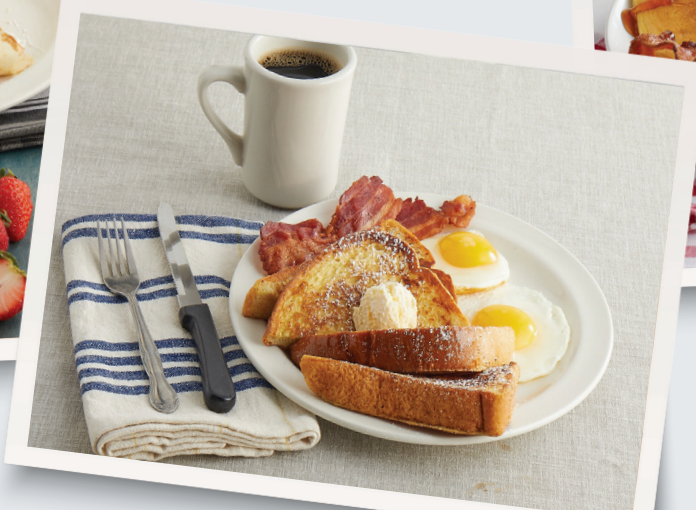
French Toast Eggs and Bacon