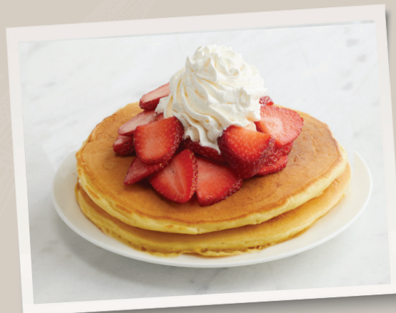
Lighter Fare Pancakes