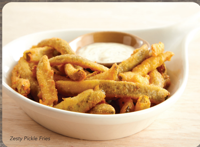
Zesty Pickle Fries

Thin-cut dill pickle fries coated in a premium cornmeal batter with a touch of spice. Served with creamy garlic sauce. 910 cal. 8.49