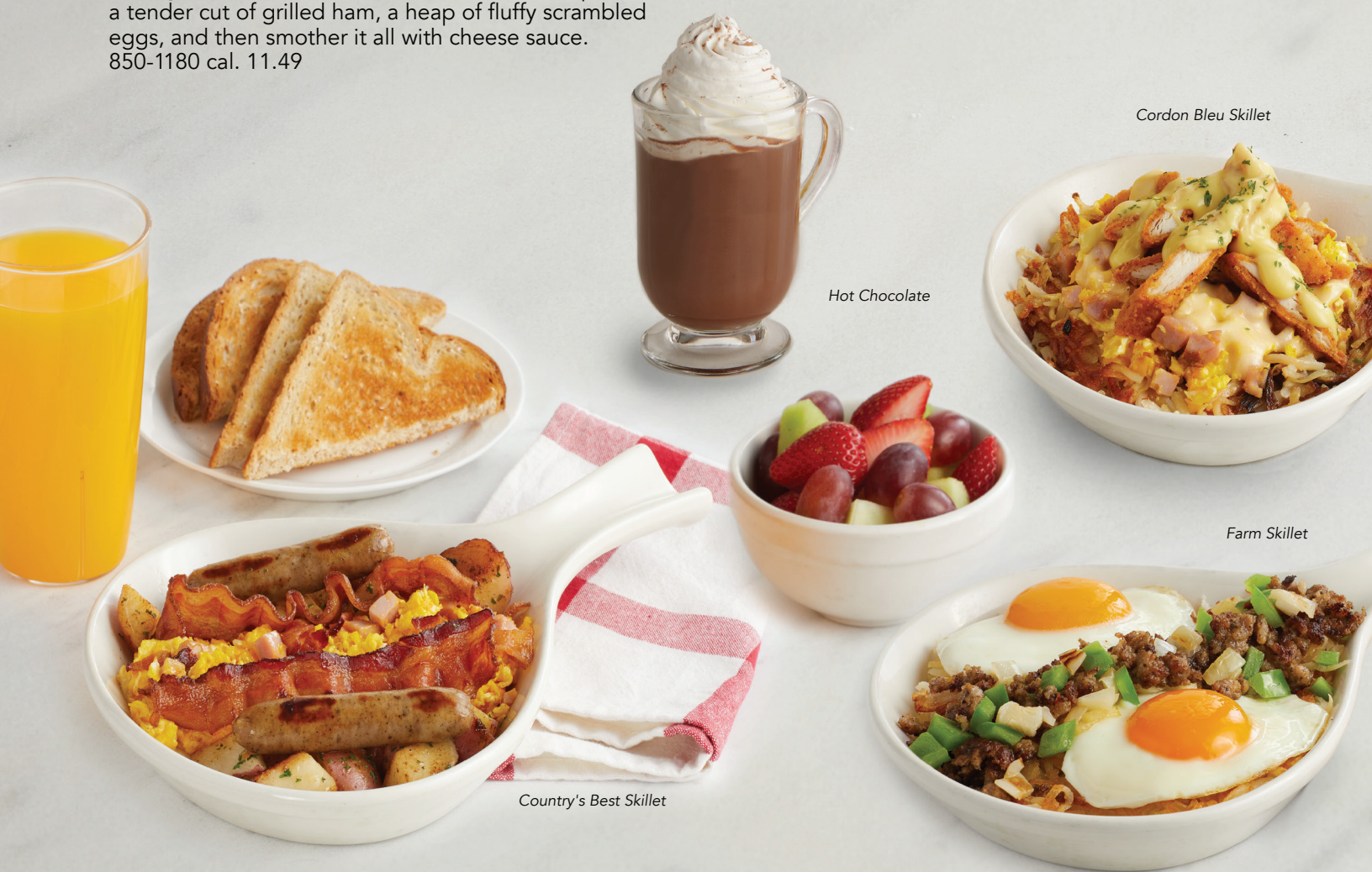
Cordon Bleu Skillet

Two eggs any style with chopped sausage, onion, and green peppers on a bed of seasoned hash browns. 570-930 cal. 11.49