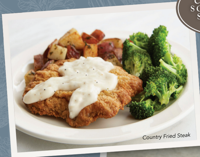
Country Fried Steak

Slices of oven-roasted turkey placed on a bed of our savory sage stuffing and ladled with hot turkey gravy. Served with a side of cranberry sauce. 690-1730 cal. 14.49