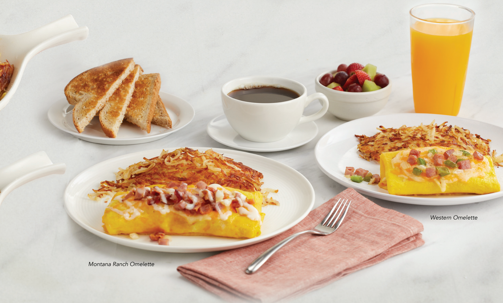
Montana Ranch Omelette

Add cheese, diced bacon & grilled onion to your hash browns 170 cal. 2.49