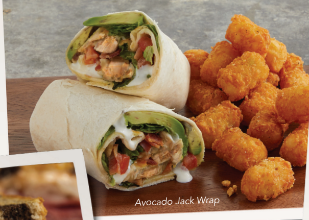
Avocado Jack Wrap