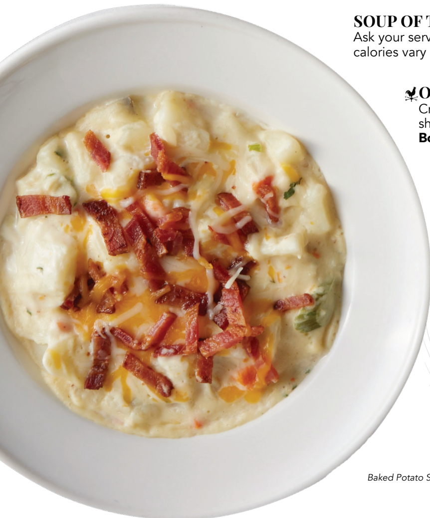
Baked Potato Soup

Creamy baked potato soup topped with our shredded four-cheese blend and chopped bacon. Bowl 370 cal. 6.99 • Cup 180 cal. 4.99