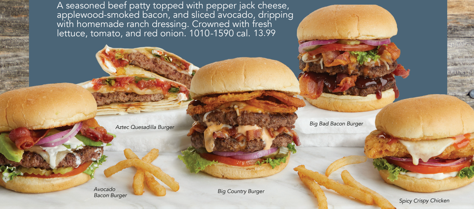
Aztec Quesadilla Burger

A seasoned beef patty topped with pepper jack cheese, applewood-smoked bacon, and sliced avocado, dripping with homemade ranch dressing. Crowned with fresh lettuce, tomato, and red onion. 1010-1590 cal. 13.99