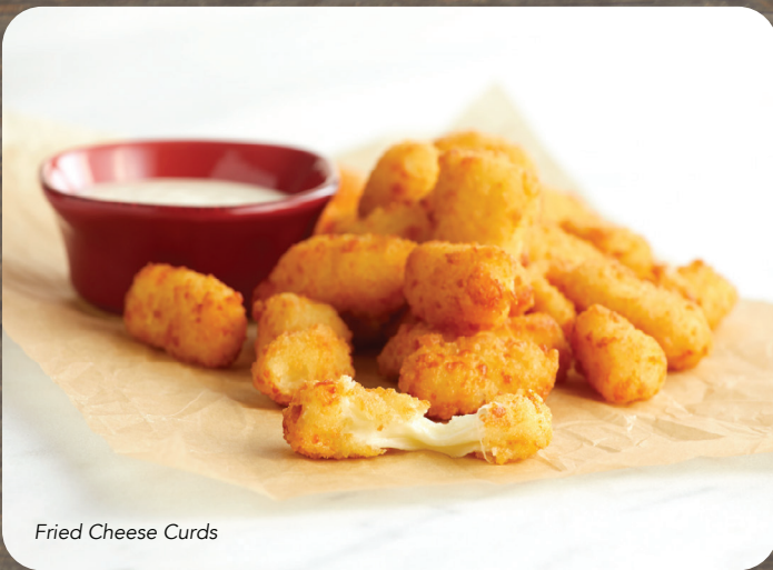
Fried Cheese Curds