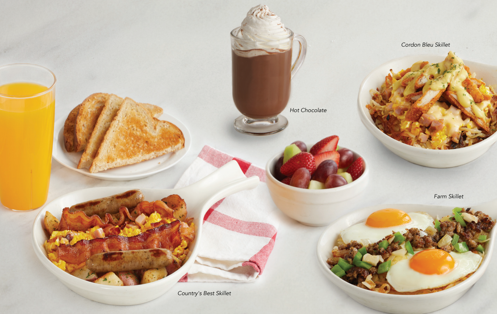
Cordon Bleu Skillet

Two eggs any style with chopped sausage, onion, and green peppers on a bed of seasoned hash browns. 570-930 cal. 12.49