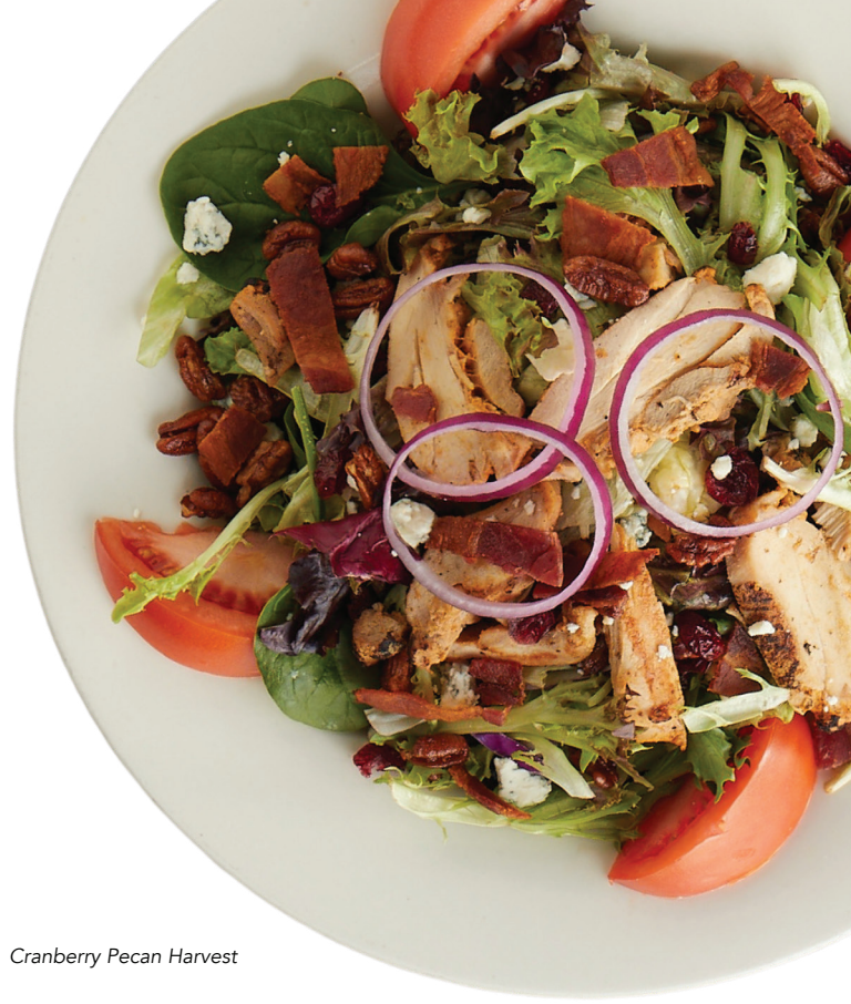
Cranberry Pecan Harvest

A bed of mixed garden greens topped with chopped applewood-smoked bacon, bleu cheese crumbles, dried cranberries, candied pecans, red onion rings, and fresh tomato wedges. Served with your choice of dressing. 460 cal. 11.99 • Add chicken 180 cal. 3.00