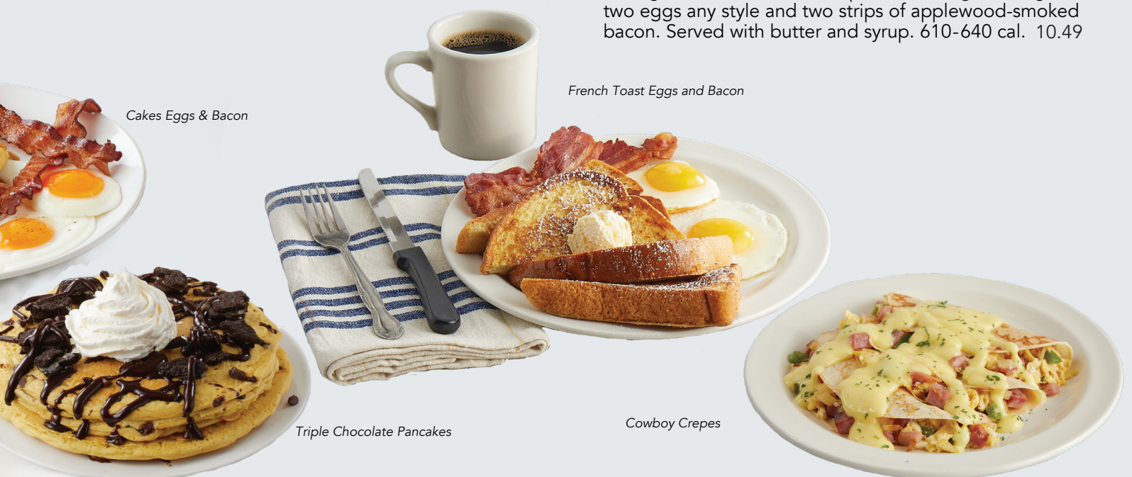
Cakes Eggs & Bacon

A Belgian waffle dusted with powdered sugar, alongside two eggs any style and two strips of applewood-smoked bacon. Served with butter and syrup. 610-640 cal. 10.49