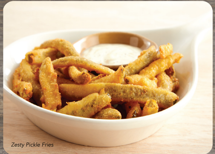
Zesty Pickle Fries

Thin-cut dill pickle fries coated in a premium cornmeal batter with a touch of spice. Served with creamy garlic sauce. 910 cal. 8.69