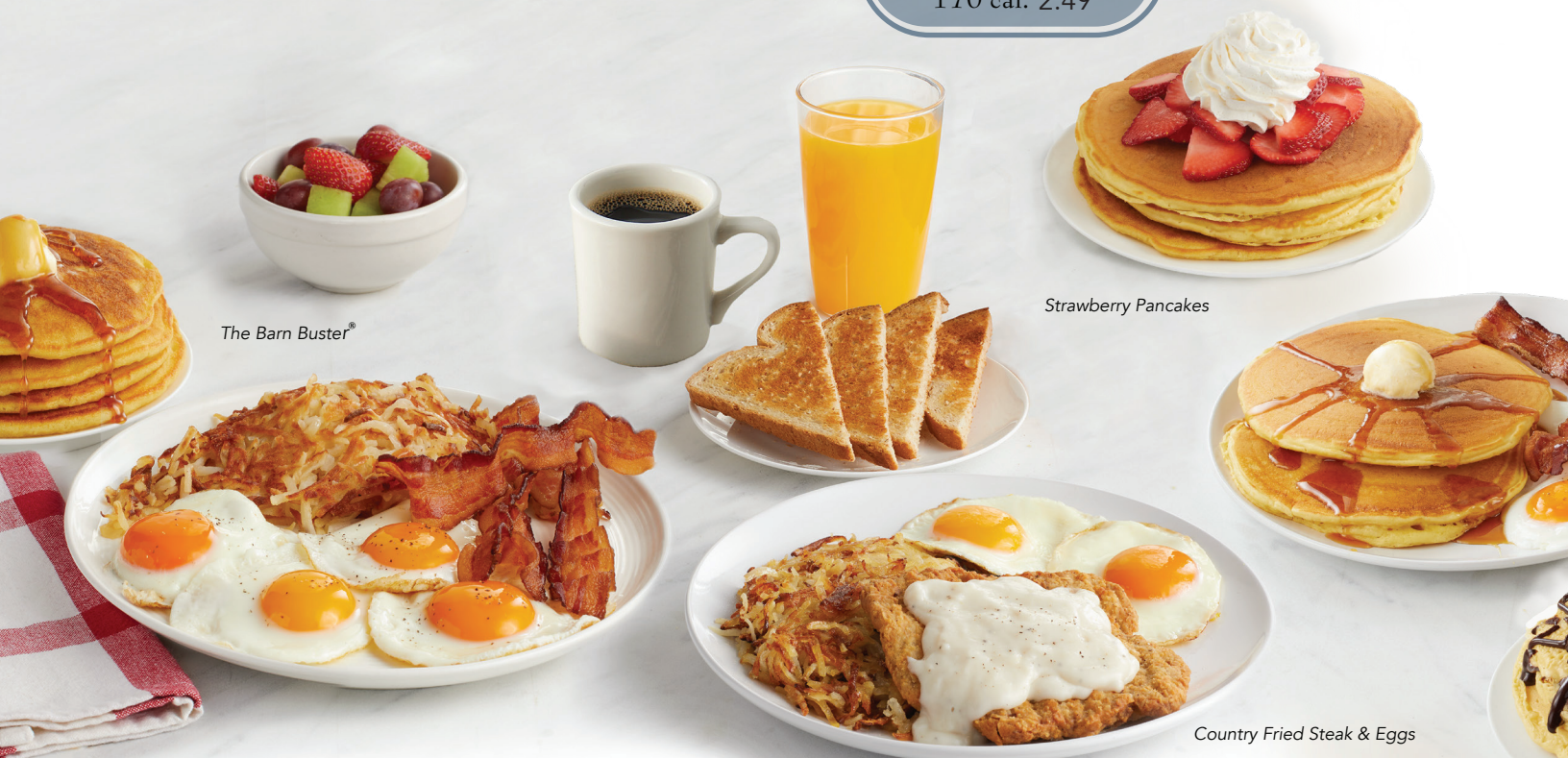
The Barn Buster®

Add cheese, diced bacon & grilled onion to your hash browns 170 cal. 2.49