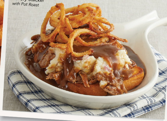
Savory Stacker with Pot Roast