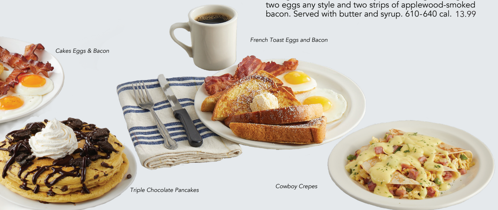
Cakes Eggs & Bacon

A Belgian waffle dusted with powdered sugar, alongside two eggs any style and two strips of applewood-smoked bacon. Served with butter and syrup. 610-640 cal. 13.99