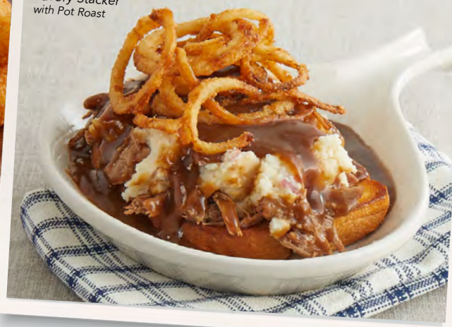
Savory Stacker with Pot Roast