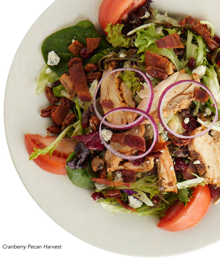
Cranberry Pecan Harvest

A bed of mixed garden greens topped with chopped applewood-smoked bacon, bleu cheese crumbles, dried cranberries, candied pecans, red onion rings, and fresh tomato wedges. Served with your choice of dressing. 460 cal. 10.99 • Add chicken 180 cal. 4.99