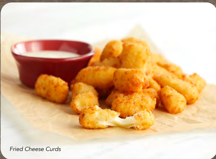
Fried Cheese Curds