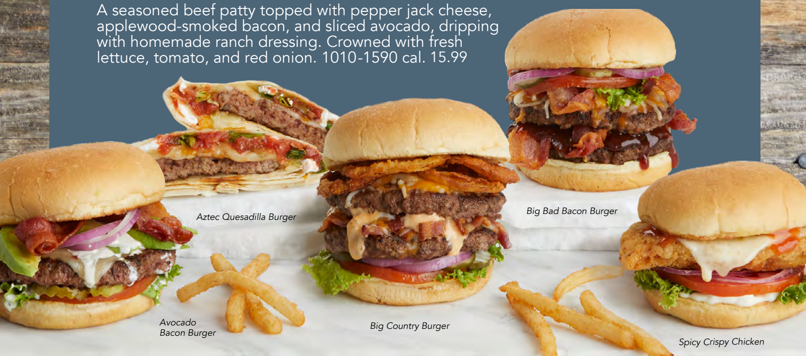
Aztec Quesadilla Burger

A seasoned beef patty topped with pepper jack cheese, applewood-smoked bacon, and sliced avocado, dripping with homemade ranch dressing. Crowned with fresh lettuce, tomato, and red onion. 1010-1590 cal. 15.99