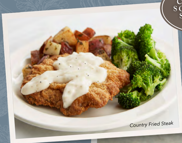
Country Fried Steak

Slices of oven-roasted turkey placed on a bed of our savory sage stuffing and ladled with hot turkey gravy. Served with a side of cranberry sauce. 690-1730 cal. 15.99