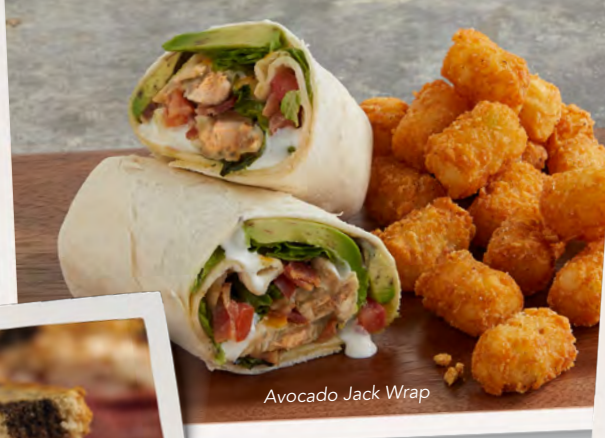
Avocado Jack Wrap