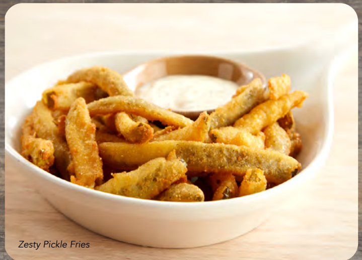
Zesty Pickle Fries

Thin-cut dill pickle fries coated in a premium cornmeal batter with a touch of spice. Served with creamy garlic sauce. 910 cal. 13.99