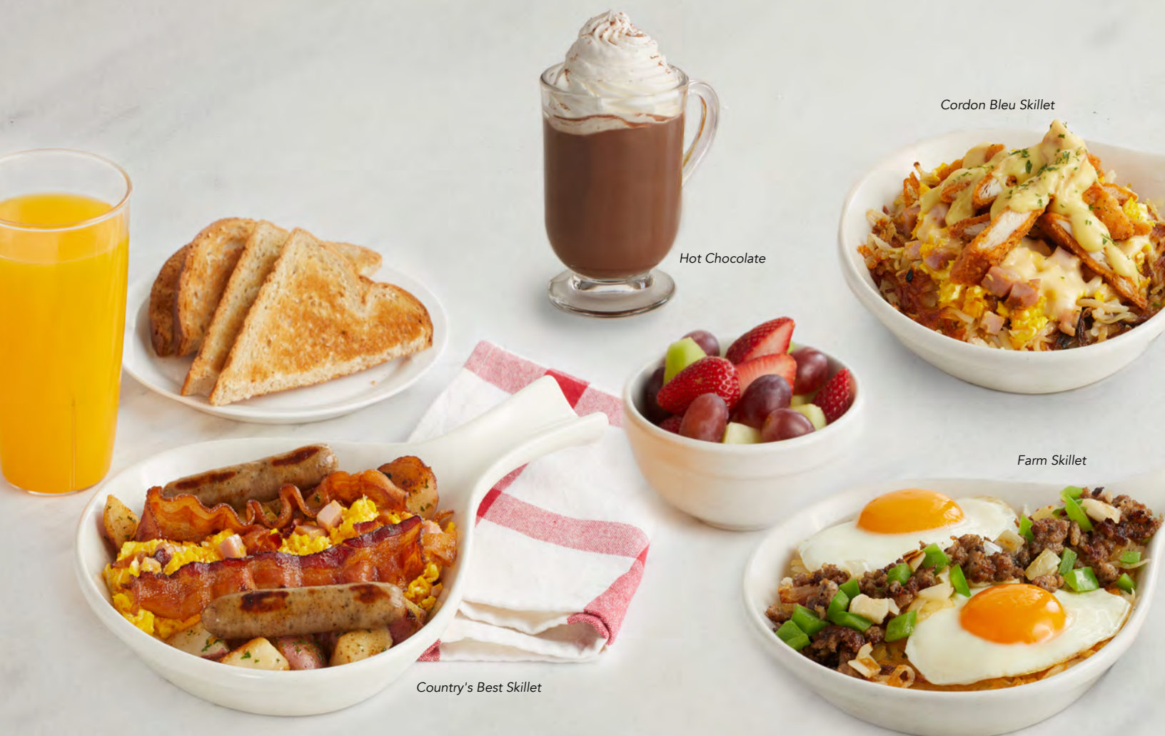
Cordon Bleu Skillet

Two eggs any style with chopped sausage, onion, and green peppers on a bed of seasoned hash browns. 570-930 cal. 14.99