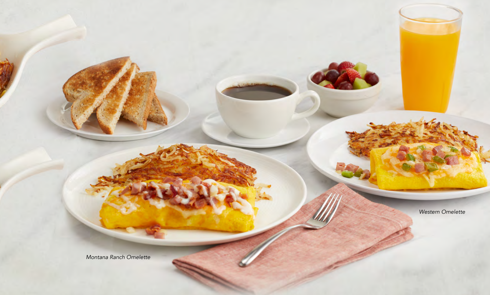
Montana Ranch Omelette

Add cheese, diced bacon & grilled onion to your hash browns 170 cal. 3.49